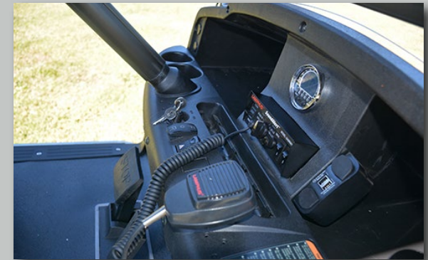
Speedometer, odometer, charge meter and PA system