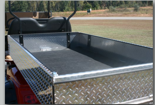
Heavy-duty recycled tire insert