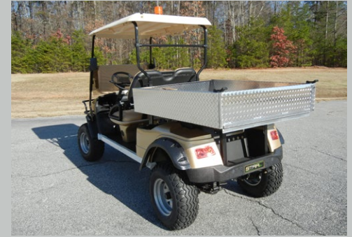
Fold-down tailgate on dumping box