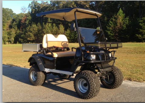
Also available in 2H style (Sport 48-2H)